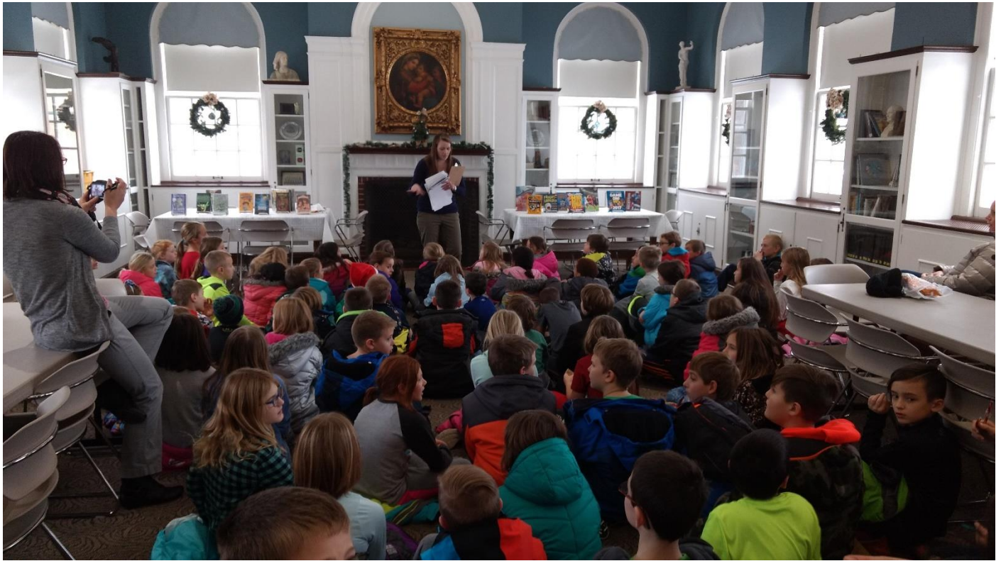
4 th graders enjoyed a visit to Chromaine library. Many students even got a library card!